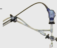
VITOM® II ICG 20 9160 25 AGA Accessories: 28272 UGN/CN 28272 HC 28172 HR/HM