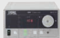
D-LIGHT P: 20 1337 01-1 Spare Lamp: 20 133028 Lamp Module: 20 1337 25